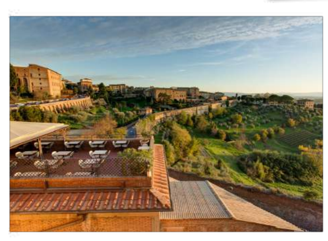
The Kraft rooftop is where we'll kick off our journey... the sky's your limit, bella!