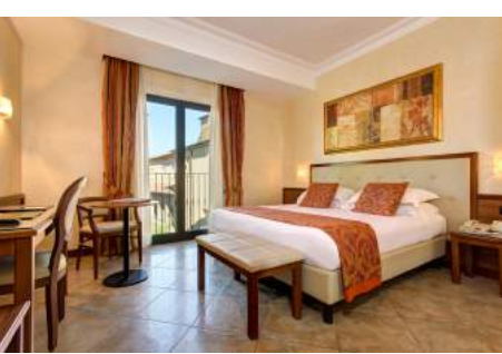
Siena's Hotel Athena is a 4-star jewel with one of Tuscany's best rooftops