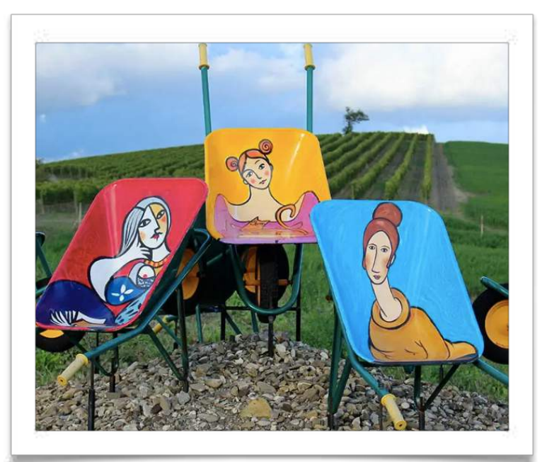
The Cinelli Colombini vineyards are filled with women-celebrating art

From our new farmhouse home in Certaldo, we'll wander this enchanting medieval town, then get messy at a hands-on cooking school. Today's theme is Food and we'll chew over the natural, liberating Italian approach to food, while enjoying timeless rural meals and wine overlooking the Tuscan countryside.