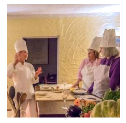
A La Bellezza moment, waiting for you